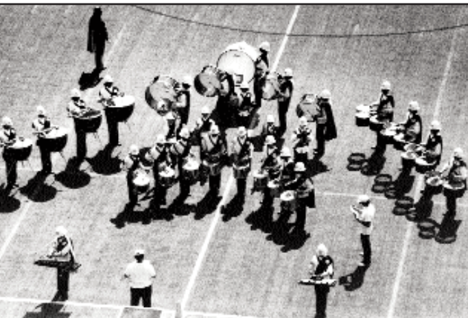
(Above) Phantom Regiment, August 20, 1996, at the DCI Championships in Philadelphia, PA ; (below) De La Salle Oaklands, 1973, at DCI Prelims in Whitewater, WI.