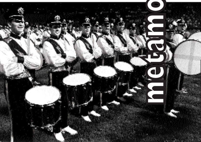
(Above) Connecticut Hurricanes, August 27, 1967; (right) Chicago Royal Airs, August 24, 1966.