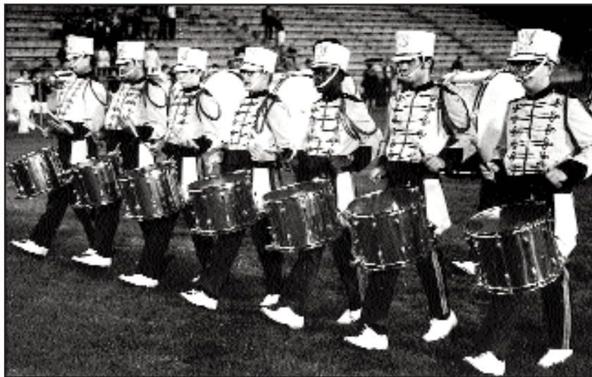
St. Lucy's Cadets, July 26, 1969, in Bridgeport, CT.

Dowlan comments, "In 1961, while teaching the Vasella Muskateers junior corps, we were penalized for not playing Swiss