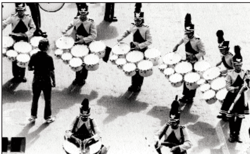
Spirit of Atlanta, August 18, 1977, at the DCI Championships in Denver, CO.