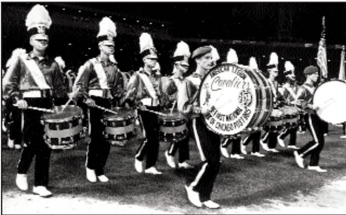
Chicago Cavaliers, August 27, 1967, at American Legion Nationals in Boston, MA (photo by Moe Knox from the collection of Drum Corps World).

A state contest would normally consist of 100 units of the various categories, as well as individual competitions on drumming, bugling, fifing and baton twirling.