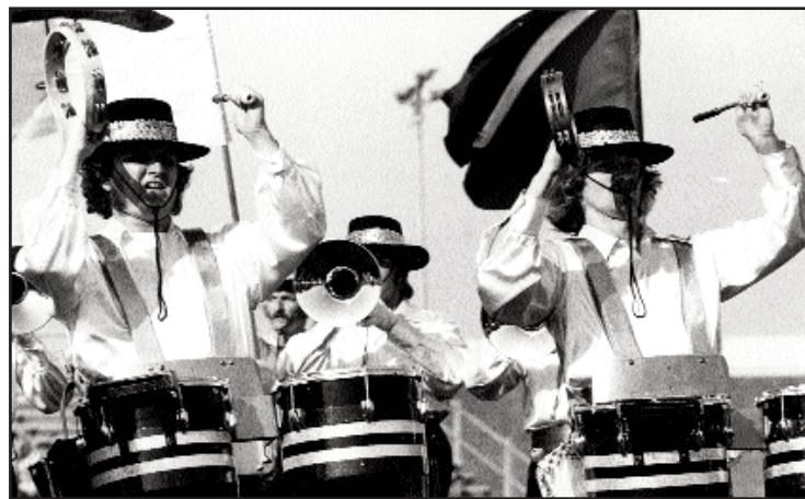
Hawthorne Caballeros, 1972 (photo from the collection of Peter Bishop).

Imagine if a trend developed where scales were no longer considered mandatory for wind players.