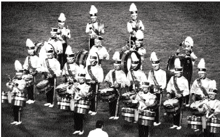
Reading Buccaneers, July 3, 1971, in Bridgeport, CT.