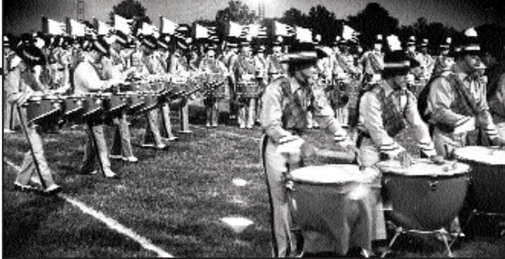
27th Lancers, 1980 (photo by Moe Knox from the collection of Drum Corps World).

Both organizations remained strong during the decade following World War II. Eventually the AL relaxed the membership