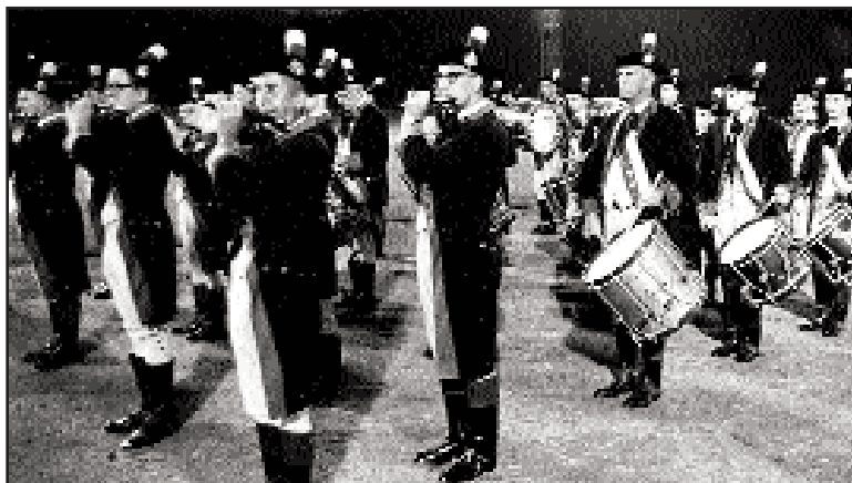
Mattatuck Drum Band, July 29, 1967, on the occasion of the organization's 200th anniversary.

The growth of competitions continued and, in 1885, the Connecticut Fifers and Drummers Association was established to foster expansion and improvement. Annual field day musters for this association continue to this day and the individual snare and bass drum winners have been recorded