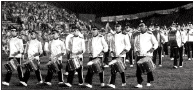
Reilly Raiders, 1968.