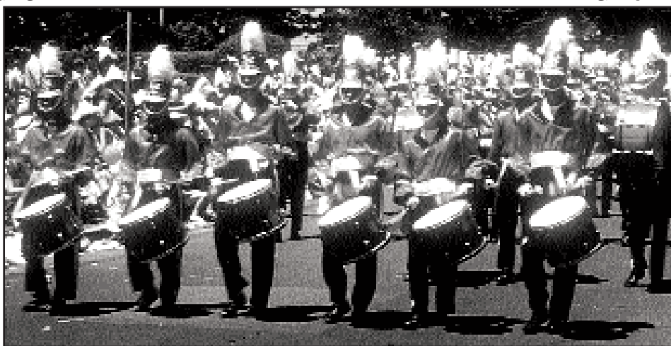
Archer-Epler Musketeers, July 1959, in Bridgeport, CT.