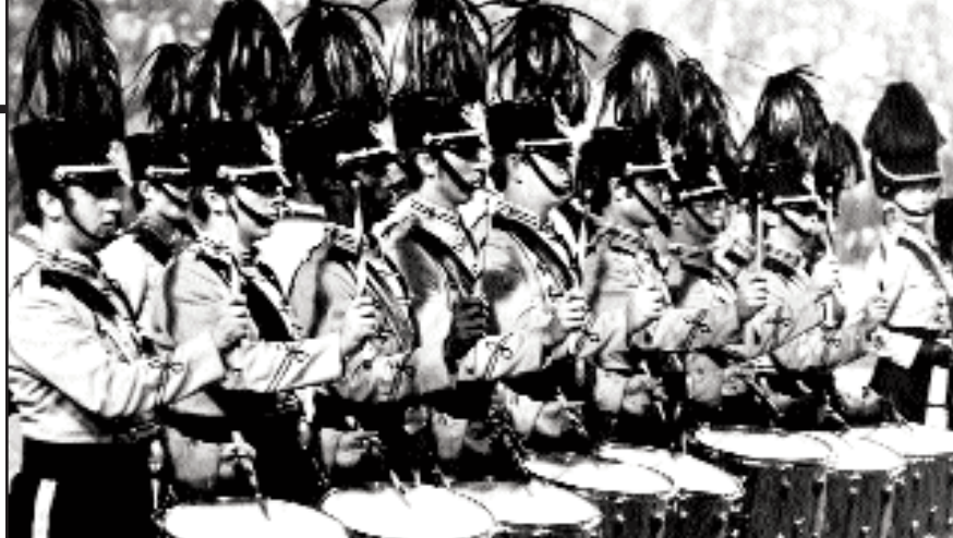
Blue Rock, July 17, 1971, at the World Open (photo by Moe Knox from the collection of Drum Corps World).

Moeller was a staunch advocate of the rudiments, not just for rudimental drummers, but for all areas of drumming. He traveled with a musical show across the continent teaching drummers everywhere the