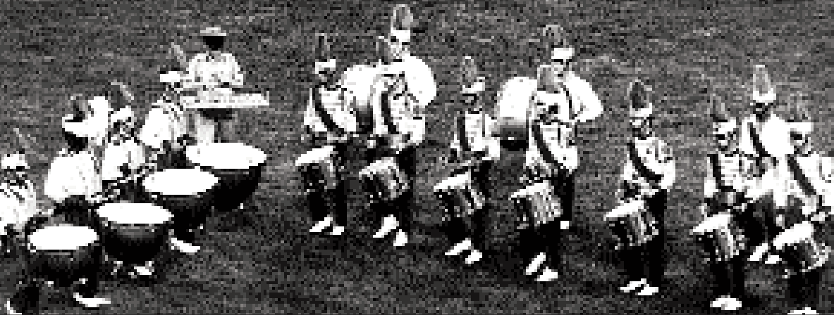
Long Island Sunrisers, July 5, 1969, at Bridgeport, CT (photo by Moe Knox from the collection of Drum Corps World).