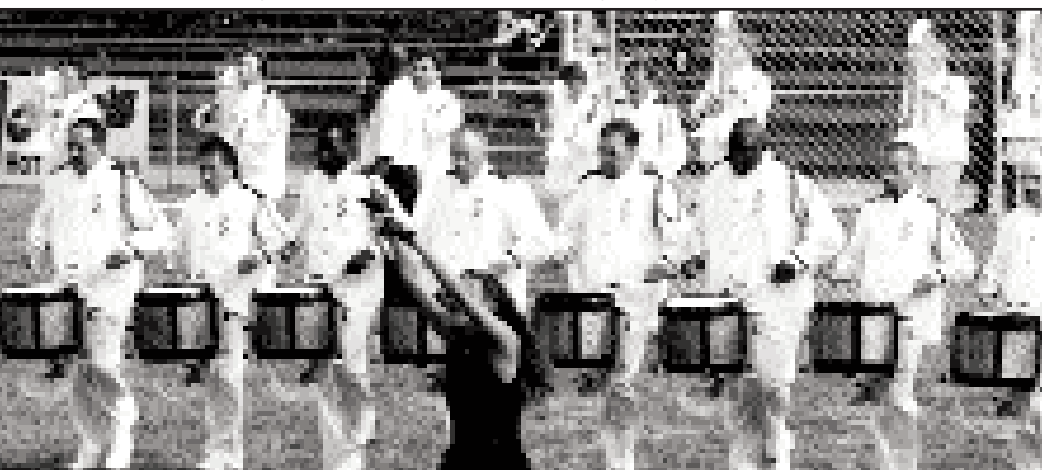
Empire Statesmen, August 30, 1997, at DCA Prelims in Allentown, PA.

The capitulation of adding more percussion instruments reached a climax in 1977 when the Spirit of Atlanta junior corps, under the percussion direction of Dan Spalding, used a total of 120 separate playable instruments within the percussion section in a show in Atlanta. 32 This occurred five years before the advent of the pit.