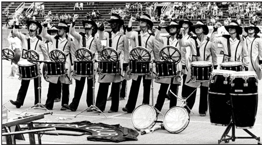
Bayonne Bridgemen, 1982, at DCI Championships in Montreal, QUE (photo by Dale Eck from the collection of Drum Corps World).

rudiments, accents and dynamics. Each contestant could take as much as 15 and a half minutes of judging time. Additionally, the AL National Individuals, at least from 1950-1954, had four categories of entries: the senior veteran, for veterans of the Spanish-American War and World War I; the junior veteran, for veterans of World War II; the senior open, for anyone 21 years and older; and the junior open, or anyone between the ages of 14 and 20.