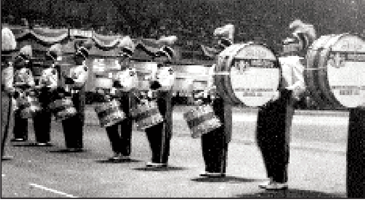
Skokie Indians, 1957, at American Legion Nationals in Atlantic City, NJ.

NARD list of rudiments for use in all high school bands in the country.