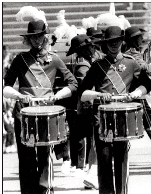
Santa Clara Vanguard, 1978 (photo by Art Luebke from the collection of Drum Corps World).

The 20 points for percussion was divided