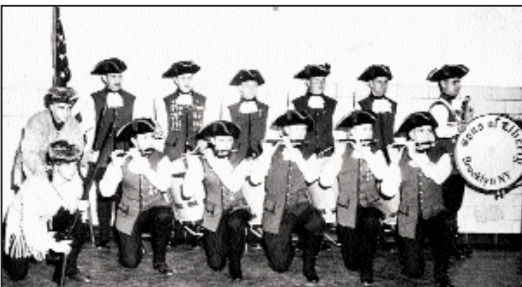
Sons of Liberty Fife and Drum Corps, 1957 (photo from the collection of Bob BellaRosa/Eastern Review).

The truth of that quote can be directly attributed to the promotion of the rudiments by NARD and Ludwig.