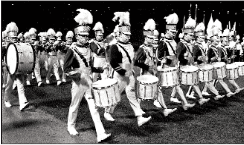
St. Mary's Cardinals, August 27, 1967, at American Legion Nationals in Boston, MA.

demonstrate high-lifting rudimental rolls on a marimba.