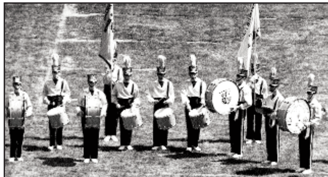
Blessed Sacrament Golden Knights, June 3, 1962.

nation. Arsenault taught Mitch Markovich, three-time national VFW junior snare champion from 1961-1963 who went on to teach the two-time national champion Chicago